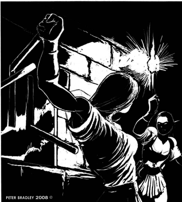
PETER BRADLEY 2008 ©

A massive throne of lapis lazuli dominates this chamber, it rising from a dais of inky black marble with swirls of grey. Behind the throne hangs a gonfalon of purple silk, it embroidered and tasseled with gold thread. Flanking the throne you note arched windows 8 feet wide by 12 feet high, these veiled by diaphanous, pale green curtains. Lambent balls of light hover inches below the 20 foot peak of this chamber, the north and south verges of which are of 10-foot height.